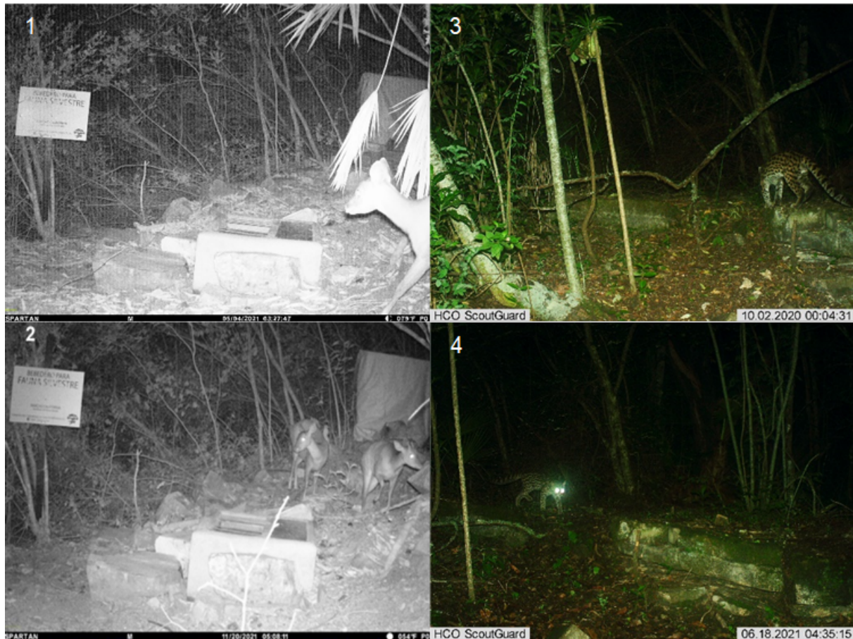
Figure 3. First photographic records of Leopardus wiedii and Mazama temama in the Altas Cumbres NPA:

1) Image of a red brocket deer recorded on May 4 by the CTN1MAM station; 2) Photographic of two red brocket deer in Altas Cumbres NPA; 3) Photographic of male margay on October 2 by the CTN2MAM; 4) Image of margay recorded on June 18 by the CTN3MAM.